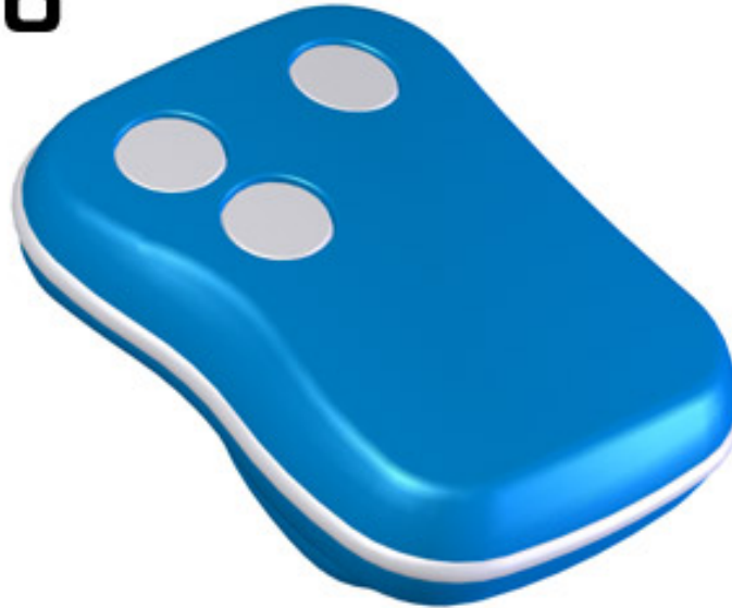
CA-10, 3 button

Click to View: (0 button) (1 button) (2 button) (3 button) (4 button) (5 button) (6 button)